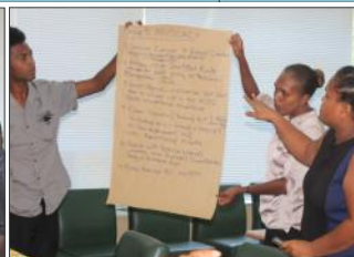
Presentations during 1st Group meeting workshop on 20 February at PTC