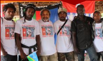
Free West Papua supporters and activists during the IWD opening event on March 10.