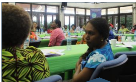
Delegates who attended the YWPG presentation