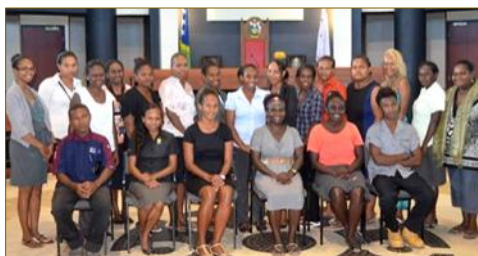
First group meeting photo in February 2015