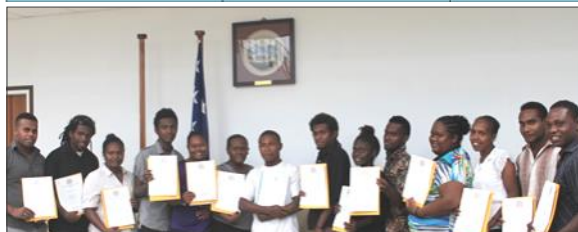
Surveyors under Y@W receive certificates during presentation of Voter Behavior Survey report at Paul Tovua complex (PTC)