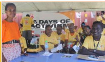
YWPG members at the stall to promote the film festival (right).