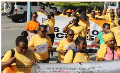
YWPG members & supporters join the march to Art Gallery