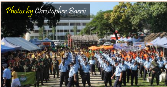
16 Days Activism march ends at Art Gallery. It was from 27 Nov—10 Dec 2015