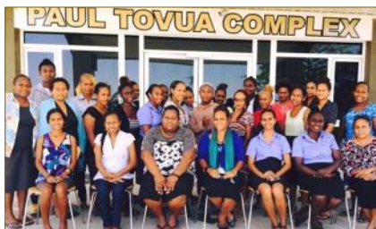
Second group meeting photo in May 2015

A forum where young women and men coming from various fields in public, private and voluntary, experience and take part in leadership.