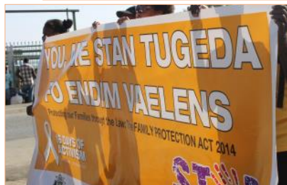
Banner and theme of the 16 Days of Activism