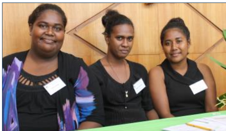
YWPG members volunteering at the Registration desk

The Conference had high level delegates, women and men leaders from the region, Solomon Islands public and associative sectors. These were Ministers, Members of Parliaments, Heads of Women's associations, representatives of international organizations, judicial, business and academic sectors.